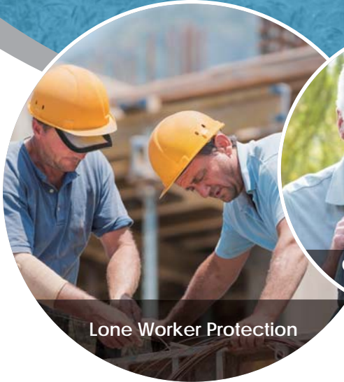
Lone Worker Protection