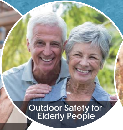
Outdoor Safety for Elderly People